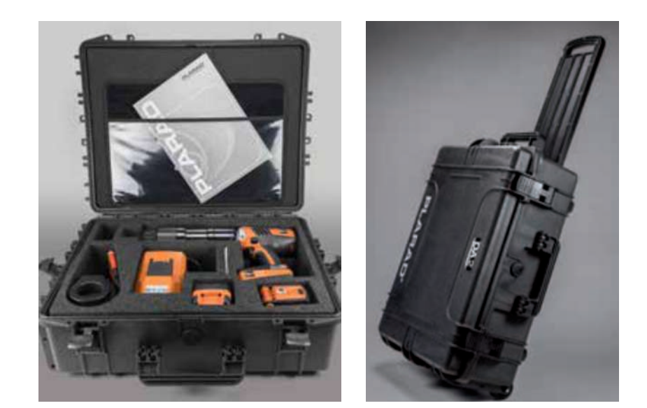
Safe storage and comfortable transport thanks to the Plarad tool case trolley

*As an alternative we do also offer larger capacity 6.0 Ah lithium-ion batteries. However regarding the method of shipping, please be aware that both battery models are subjected to the international regulations relating to the movement of dangerous goods.