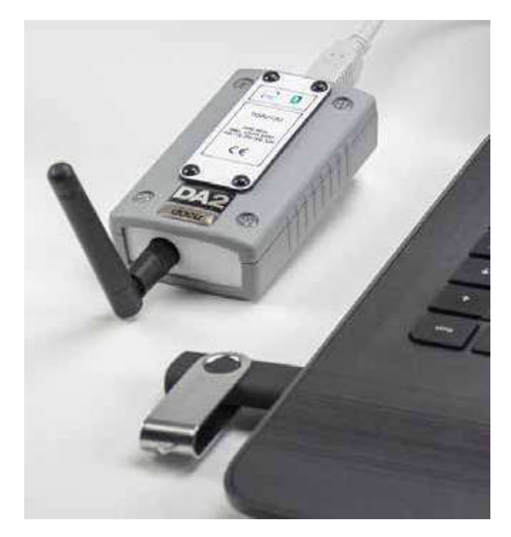
The software is supplied on a USB stick. The software is executable from the USB stick. The ISM receiver is also included in the scope of delivery.